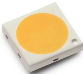
Luxeon 3030 SMD LED