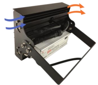
Finlike heatsink design