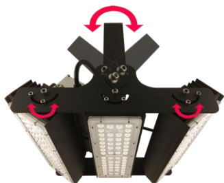
-40 to 40 degree fixing angle